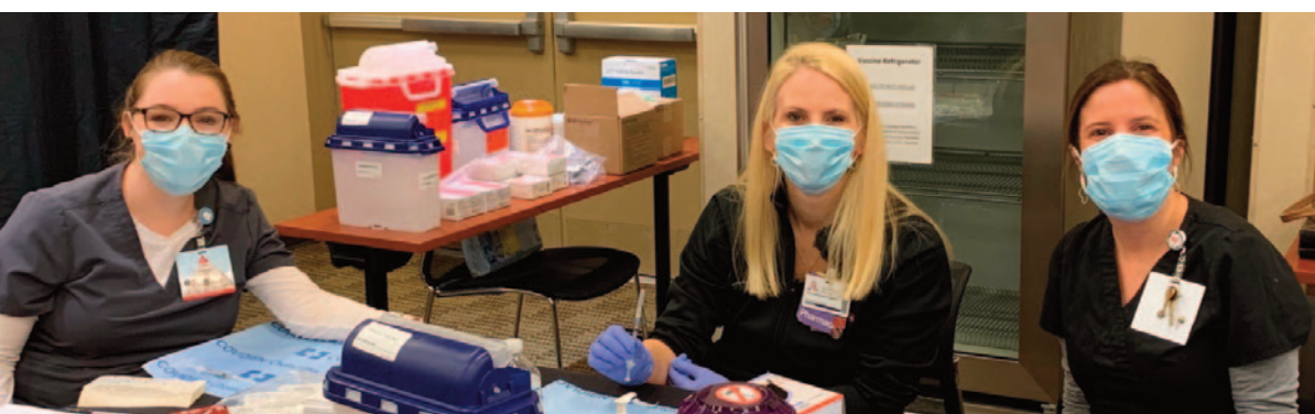
Pharmacy staff at the opening day of the Andrews Center clinic on December 18, 2020. The first shipment of vaccine had arrived only the day before and within 24 hours, members of the WakeMed family received their first dose of hope!