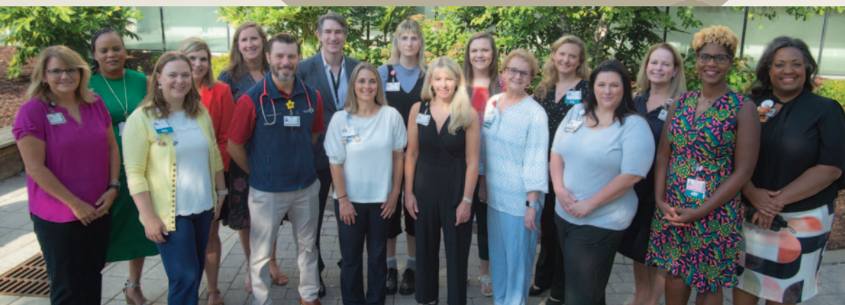
The incredible impact of WakeMed’s COVID-19 vaccination efforts are a demonstration of the Wake Way in action. Providers, nurses and staff from across dozens of departments and facilities selflessly gave their time and energy to help bring vaccines to our community members. Pictured are just some of the many, many people who made this effort so successful.