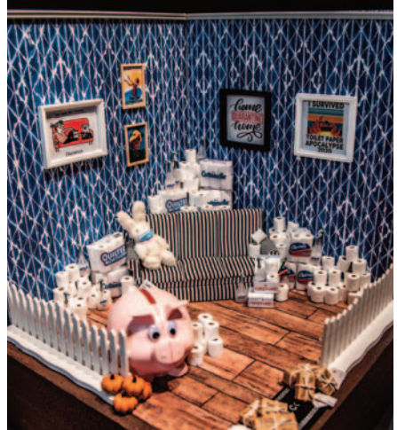
2020 Wildcard Winner:

"Piggy TP Apocalypse 2020" by Raleigh Campus Adult Acute Care Nursing (5A, 5B, 5C, 6B, 6C)